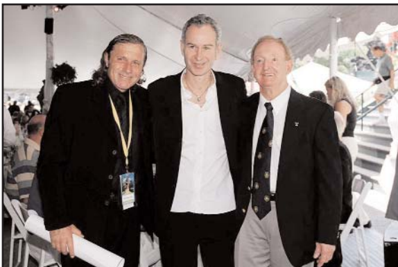
L-R: Guillermo Vilas, John McEnroe, and Rod Laver

On Sunday, thirty-nine Hall of Famers returned to center court as the Class of 2004 (Steffi Graf, Stefan Edberg, and Dorothy "Dodo" Cheney) was officially inducted and the singles and doubles finals of the Campbell's Hall of Fame Tennis Championships were played. Rod Laver, arguably one of the greatest tennis players of all-time, summed up the entire weekend. "It's been great to be here in Newport. We don't see each other often, and this has been just absolutely wonderful."