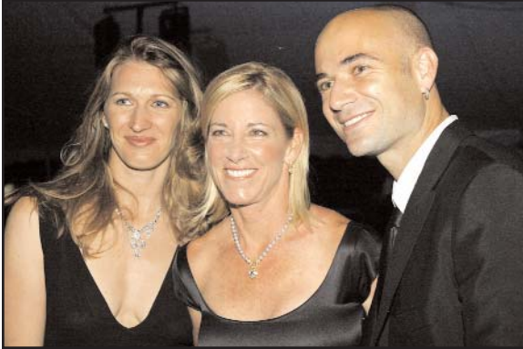
L-R: Steffi Graf, Chris Evert, and Andre Agassi

Tony Trabert, President of the International