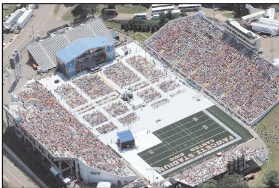
Aerial image of the 2004 enshrinement ceremony

The largest enshrinement crowd in the Pro Football Hall of Fame's 41-year history was on hand Sunday August 8, 2004 for the induction of