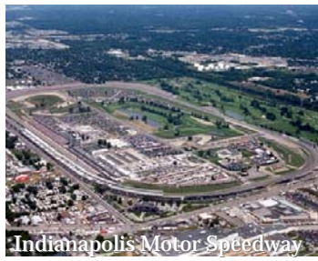
Indianapolis Motor Speedway