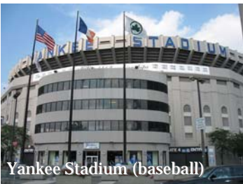
Yankee Stadium (baseball)

As sports historians, we all have well founded opinions on every-and-all-things sports, so how about offering your well founded opinion on the world's most famous sports venue. Select from one of the choices below or add your own entry. Cast your vote at celebratesportsheritage@yahoo.ca . We'll publish your results in the next newsletter.