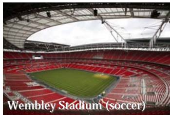
Wembley Stadium (soccer)