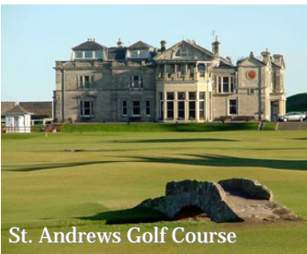
St. Andrews Golf Course